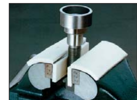
Holds on threads without damaging them.