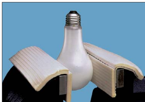
Royal "Magic/Grip" liners securely hold any fragile parts or objects without marring.